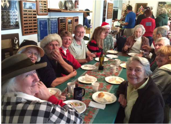
Just a few of our party-goers. More pictures at the end of the newsletter.

Our Christmas party was a grand event, enjoyed by many. Our little clubhouse was overflowing with happy eaters and drinkers.